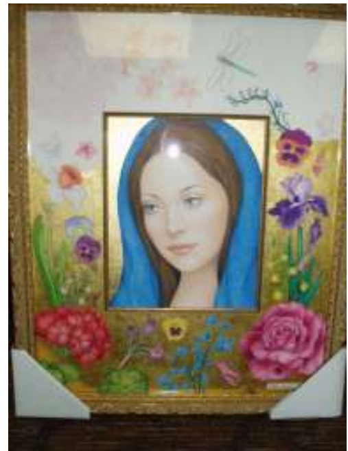
Madonna/girl with foil background