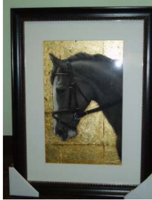
Horse with foil