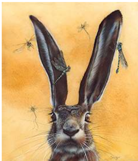
"A Bug In Your Ear," mixed media by Eileen Sorg, © 2014, all rights reserved.

Check here for updates http://bagscblog.com/